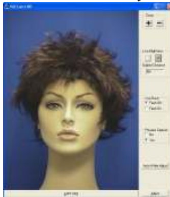
Zoom Set Correctly